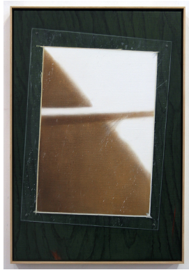
"Enigma" Oil on linen 76.2 x 51 cm 2019 $5500