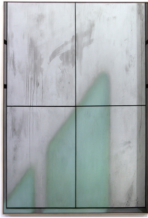
"Untitled" Oil, acrylic and aluminium pigment on linen 170 x 116.5 2019 $24,000