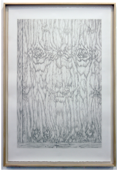
“Drawing after Large Silver”

Pencil and charcoal on Moulin Du Gue paper