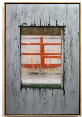
‘Silvered hoarding + view’

Oil, acrylic and aluminium pigment on linen