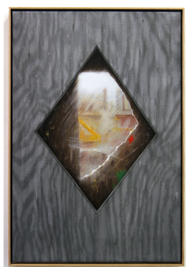
“Little diamond view”

Oil, acrylic and aluminium pigment on linen