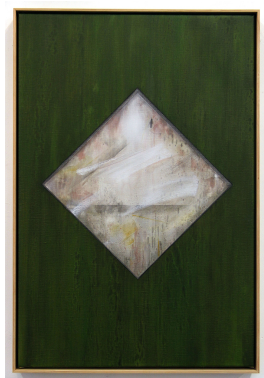
“Small green gesture”