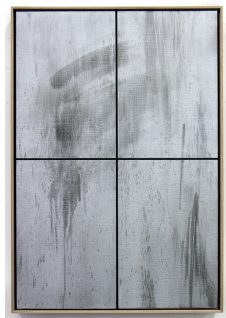
"Small Silver – Divided" Oil, acrylic and aluminium pigment on linen 61 x 41 cm 2019 $4400