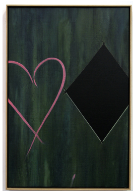
“Heart + diamond”