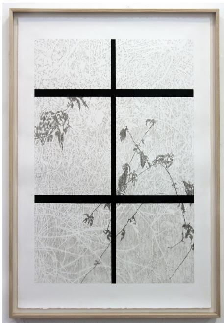
“Drawing after Silver window”

Charcoal and pencil on Moulin Du Gue paper